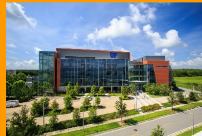
Orlando (Lake Nona)

Medication Therapy Management (MTM) PGY-1 Residency